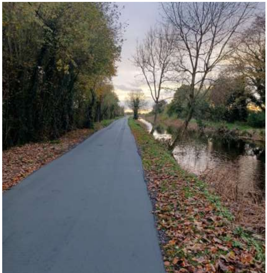
Fig1 – BallyKelly to Hugh Bridge looking South. Section completed Dec 2022

Ummeras, Chainage 18000m to 20650m – Excavation works are nearing completion with approx 2000m now complete. Sub-base installation is also well underway with approx 1300m of sub-base installed. The base layer and final surface dust will commence on completion of excavation & Sub-base construction. Target re-opening of this section is end June 2023.