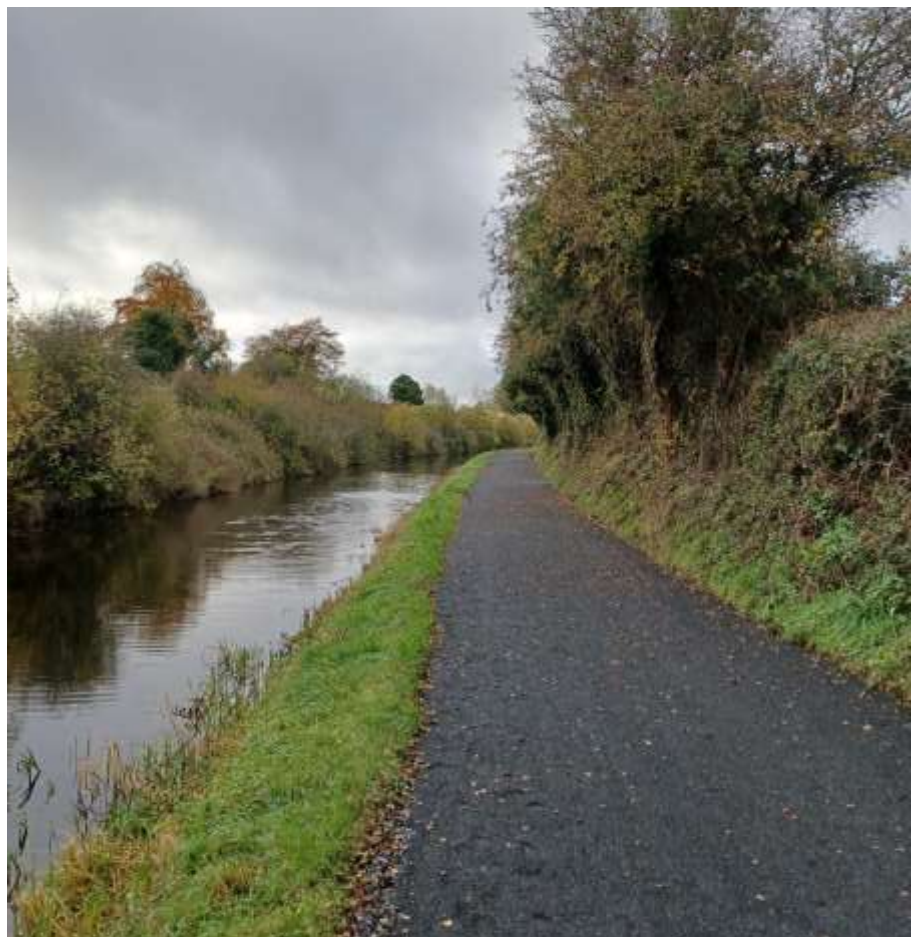
Fig 3 – CH25000 looking south. – Completed Blueway.

Progression of works between Milltown Bridge and Cardigen Lock, 3.3km, continues. Approx 1.5km of this section is receiving its final surface layer, whilst 1.2km has all base layers complete and is ready for the application of the final surface layer. Approx 600m remain to be excavated, with works commencing on this area in early June 2023. Re-opening of this section is targeted for end June.